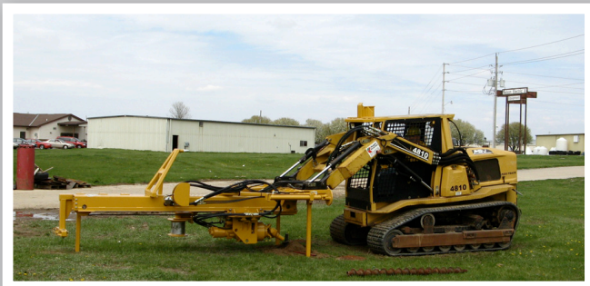
Removal/Attaching of Bandit